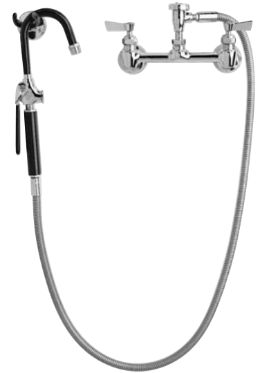
#2240 - Pot Filler: 8" Adjustable Wall Mount Control Valve with Vacuum Breaker and Wall Hook

Proposition 65 requires that we provide you with the following notice: "This product Contains A Chemical Known To The State Of California To Cause Birth Defects Or Other Reproductive Harm."